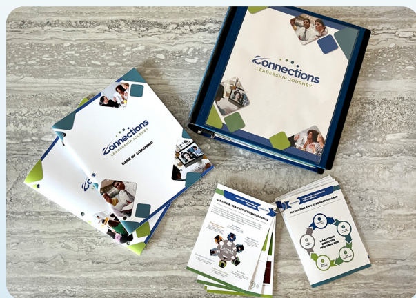
Connections Leadership Journey® Program Materials